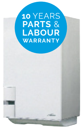
Murelle Elite HE