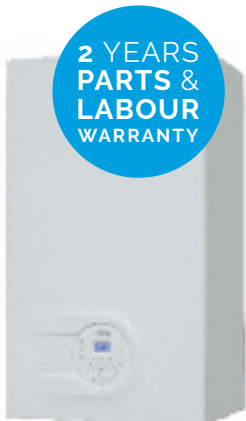
Murelle Pro HE