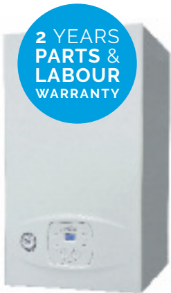
Murelle One HE

MILLIONS of PEOPLE across the WORLD rely on SIME